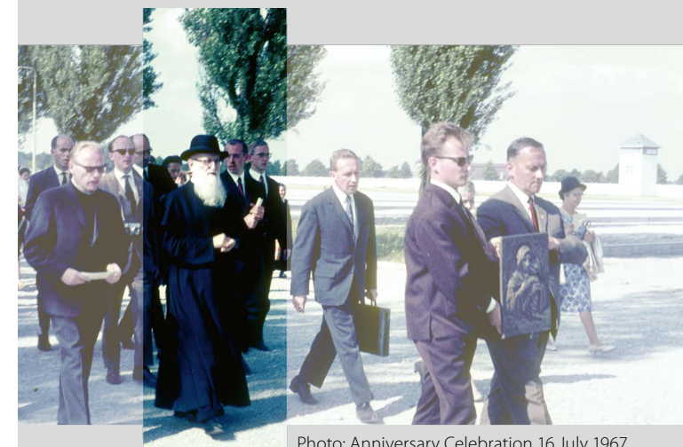
Photo: Anniversary Celebration 16 July 1967